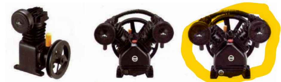
H1051 H1065 H2051 H2051A H2065