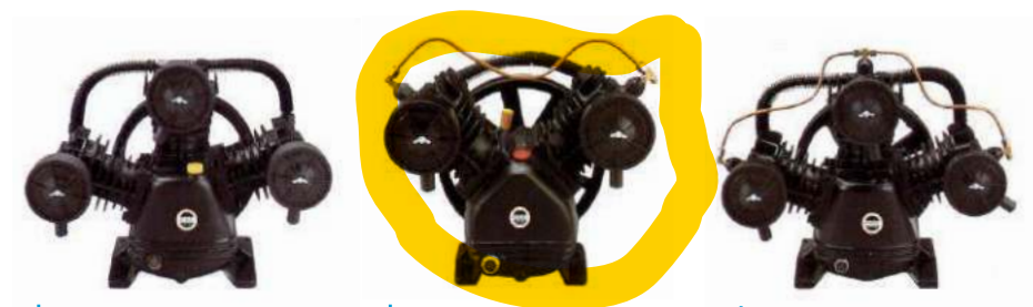
H2065Q H3065 H3065Q